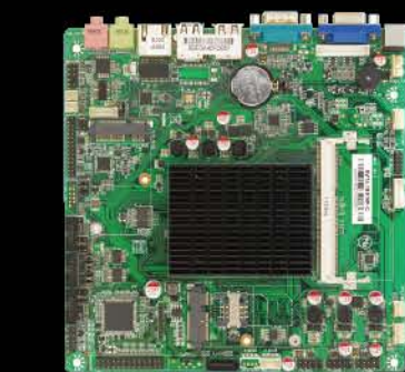
QuadCore J1900 ( Fan-less)