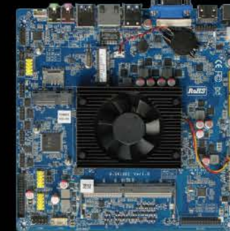
Core i5 CPU